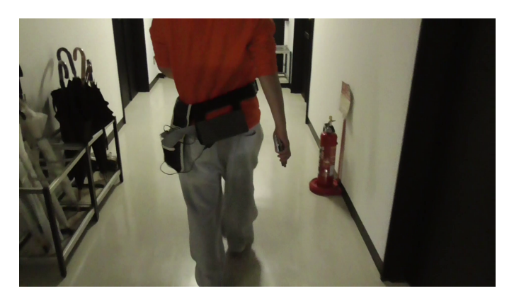
Fig. 2. A user wears the implemented system

Fig. 2 shows the implemented system worn by a user. The user wears an LED panel on the back of the waist seen in Fig. 2. The system successfully behaved as described in section III.